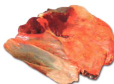
14 - Shoulder