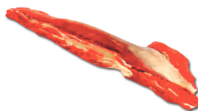
17 - Tenderloin