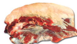
15 - Brisket