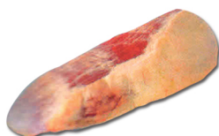
9 - Eye Round