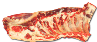
16 - Rib