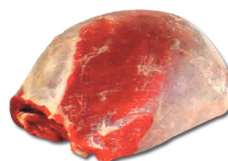
11 - Knuckle