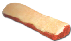
1 - Striploin