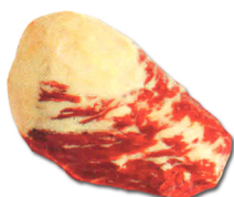
13 - Hump