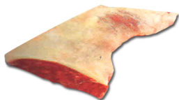
5 - Rump Tail