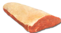
4 - Cap of Rump