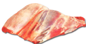
10 - Shank