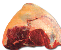
7- Top Side