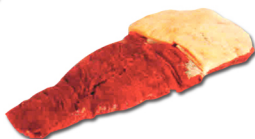
6- Inside Skirt