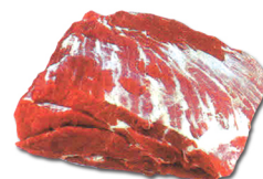
12 - Chuck